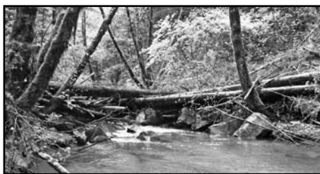
A log and boulder placement near a planting site

The native plants were grown by Elkton Charter School students at the Elkton Community Education Center (ECEC) as part of a grant through the Bureau of Land Management Rural Advisory Committee where the students learned propagation methods from ECEC staff and cared for the plants for over a year at the ECEC Native Plant Nursery. Students kept records each planting day including information such as plant species and condition, plant location, and planting site conditions.