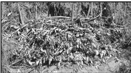
Willow structure construction.

The willow wattle and wall structures help reduce soil erosion and sedimentation along the Umpqua River at the Flick's property while at the same time providing