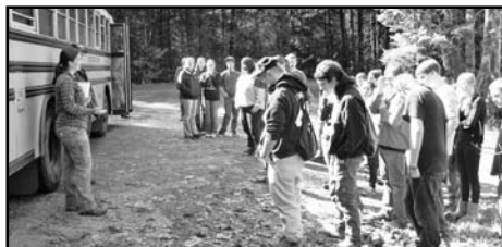
Students getting directions from staff

native plants that were historically found in the area and how to plant these native trees and shrubs which will provide diversity to the watershed by providing food and shelter for wildlife.