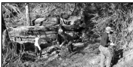
Plants placed in log & boulder placement access roads